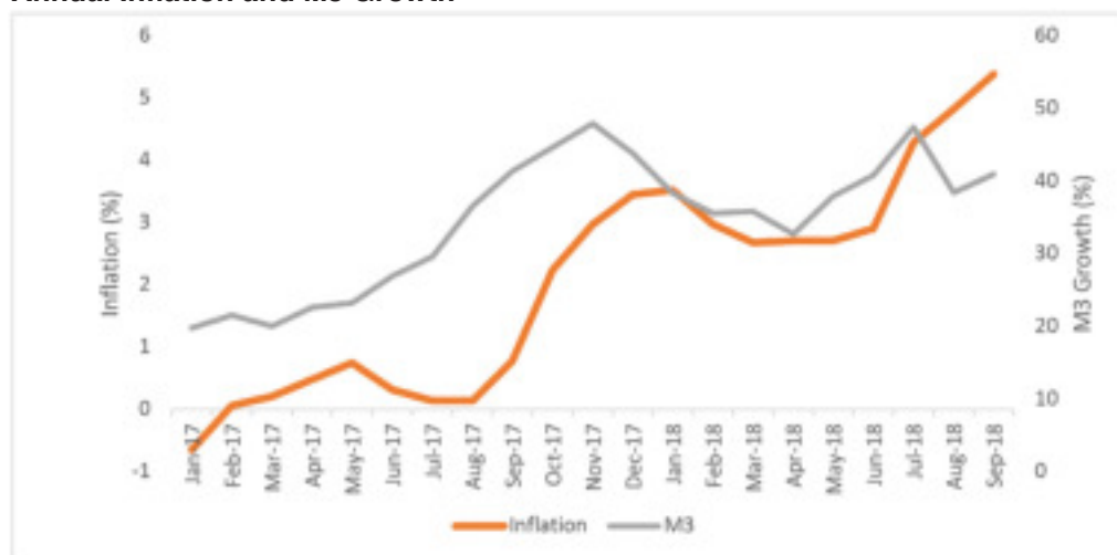
Annual Inflation and M3 Growth

59. The upsurge in inflation is a phenomenon arising from fiscal imbalances through high growth in money supply, as reflected in the graph below.