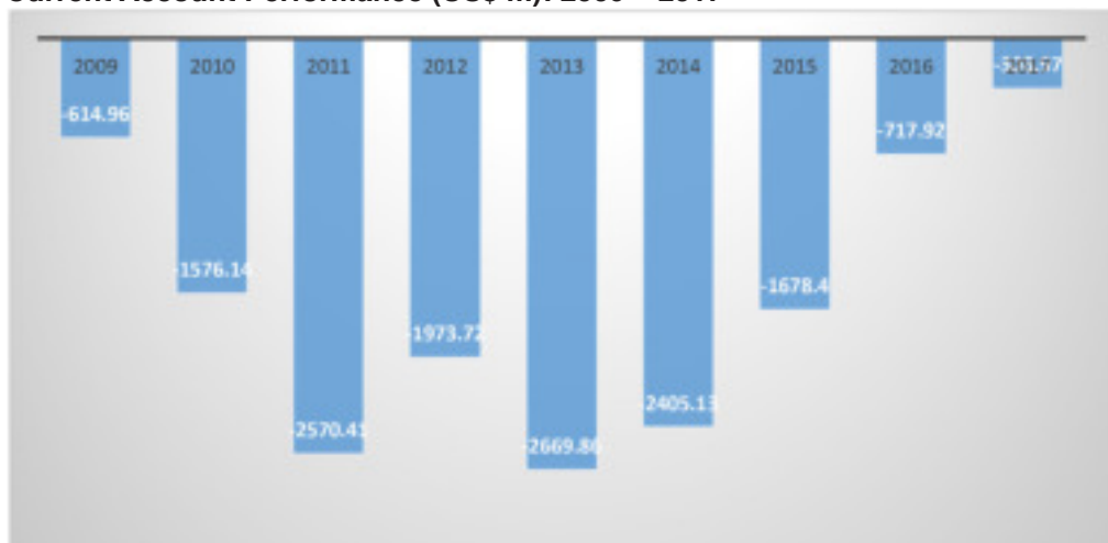
Current Account Performance (US$ m): 2009 – 2017

148. The graph below depicts the persistent of the current account deficit, meaning that more foreign currency flows out of the country than receipts.